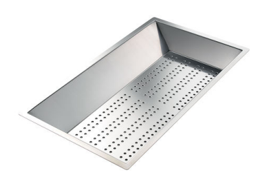
Stainless steel perforated tray

* only in combination with the accessory 8644 101