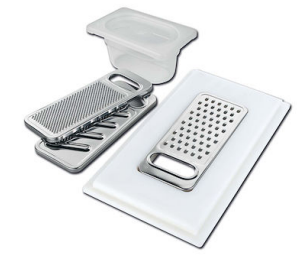
food collection tray 8159 101